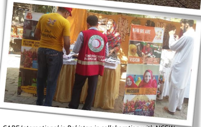
CARE International in Pakistan in collaboration with NCSW and PODA organized a policy dialogue on GBV prevention and Response at the occasion of annual rural women conference